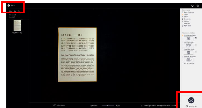
⑥ Auto Scan