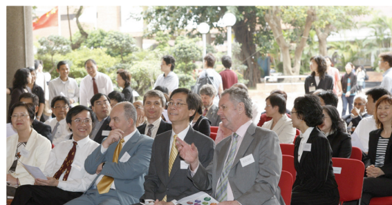
PolyU scholars and staff, and guests attending the ceremony in support of the PolyU IR launching