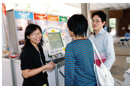
Student having a friendly chat with staff and taking the Library Challenge Game