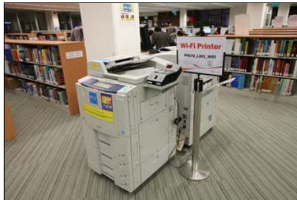
Wi-Fi Printing in REC 3/F

For further enquiries, please ask technical staff at the Technical and Support Desk on the 3/F (REC).