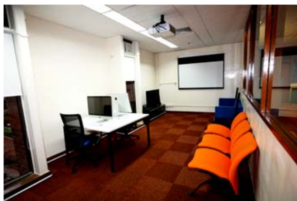
Library Multimedia Lab (LML) (Room L303e)

All PolyU students including international, Mainland and local students are invited to form teams to participate in the project. Selected Teams will be allocated a project budget of maximum HK$2,000 per student for production cost as well as full sponsorship for the Video Production Course taught by a Hong Kong-based prolific film director - Mr Godfrey Ho. Students can also have priority access to a purpose-designed Library Multimedia Lab (LML). For more details and on-line application form, please visit: http://www.lib.polyu.edu.hk/esi/