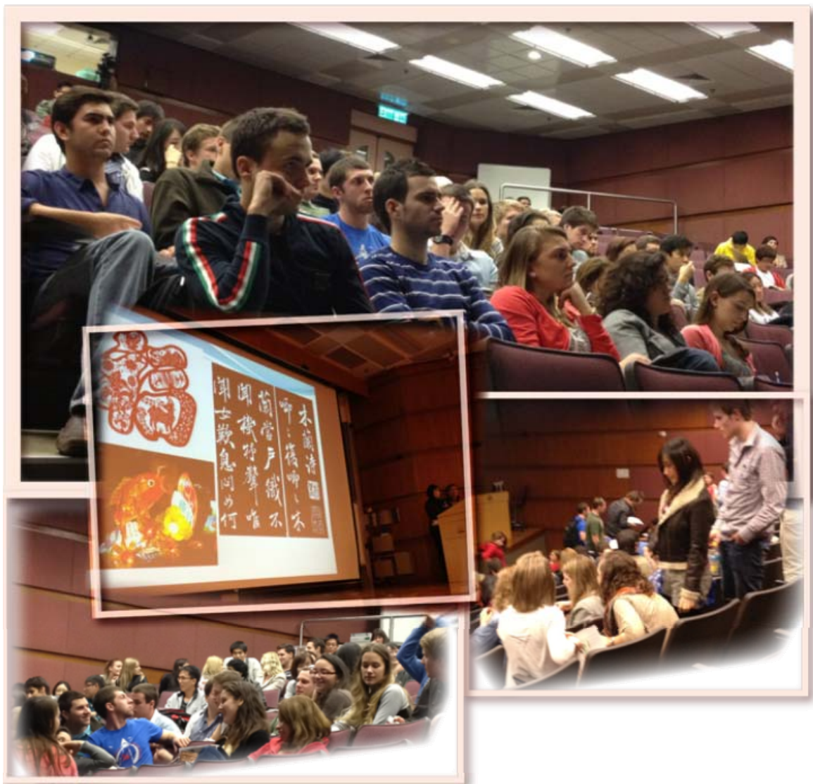
The introduction of the video project to international students.