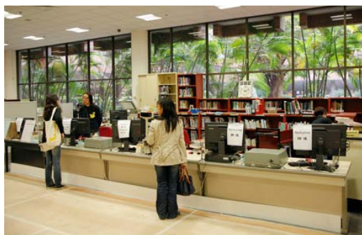
Temporary Circulation Counter on the P/F

The current newspapers are provisionally kept in Room L501 (5/F) beside the Photocopying Room.