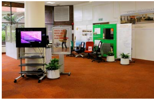
New Facilities Trial Zone