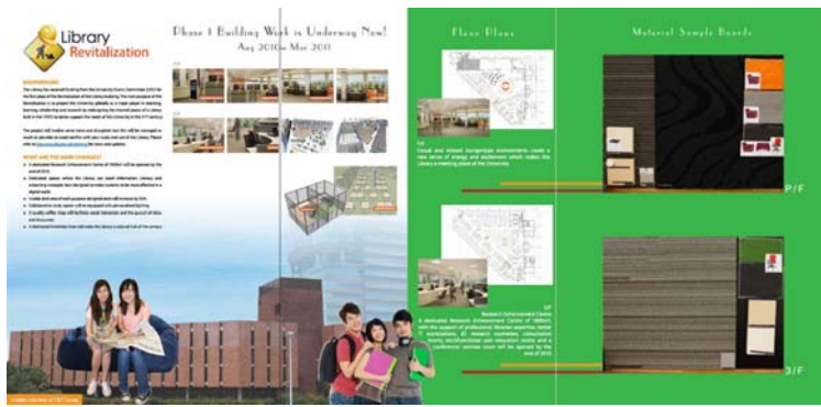
Display boards on the Phase 1 of the Revitalization Project