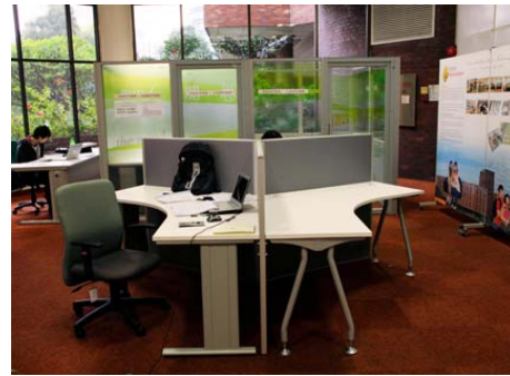
Users can't wait to use the selected samples of furniture!