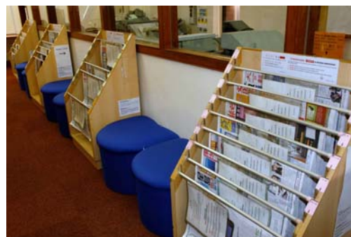
Current Newspapers Stands on the 5/F